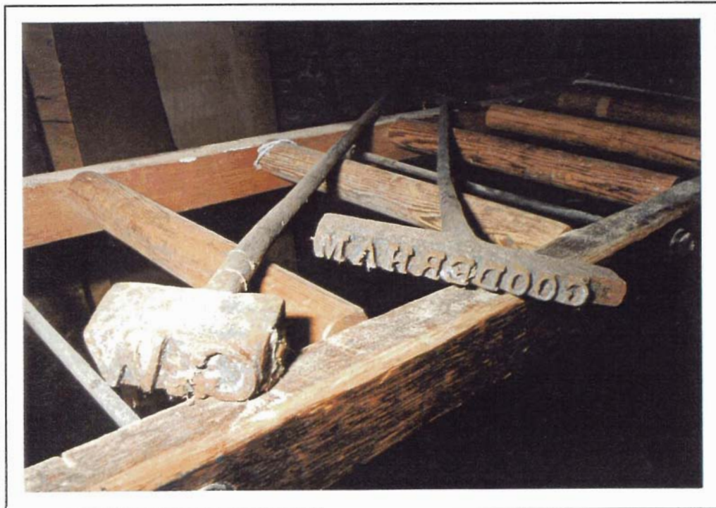
45-1-2/3 Barrel Brands