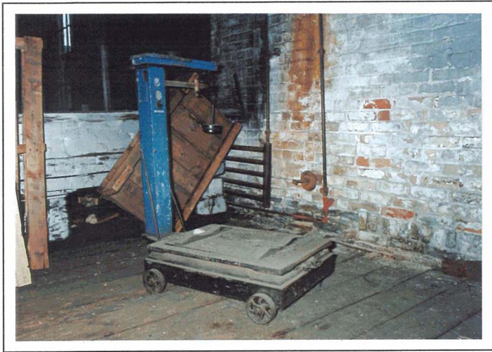
46-1-1 Platform Scale