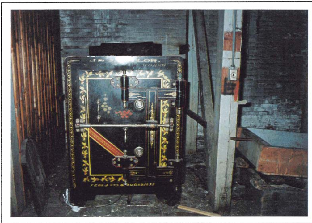
46-1-2 Office Safe