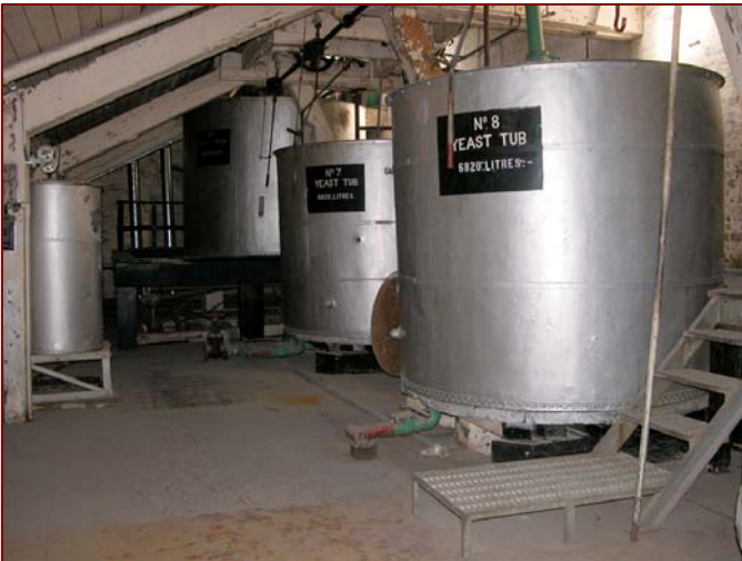
Three yeast tubs

For the first time, the Distillery District welcomes Doors Open visitors to explore one of the site's most unusual interiors: the Yeast Loft. Accessible only by stairs, the Yeast Loft has changed little since distilling stopped in 1990. As you move along the catwalk, imagine huge tanks filling the floor below and emitting an overwhelming smell of fermentation. Then inspect