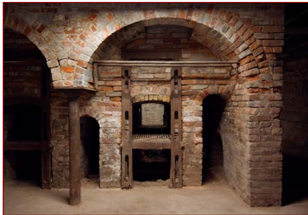
Malt Kiln Furnace